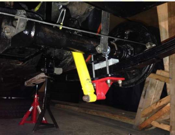
Tidied MGB Undercarriage

suspension was relatively easy until I found the O/S spring-eye bolt was seized inside its metalastic bush so the spring wouldn't come off. I therefore had one side of the axle on the floor but the gap between spring and body was too small for the brake drum to slide sideways through. By jacking the car up higher, I managed to get enough of an angle to slot the drum through and with the axle out of the way then an angle grinder released the eye bolt. The axle was treated to new bearings, diff shims to tighten up the play and to some paint. After getting all the parts powder-coated at 'Rustbusters' and new polybushes arriving, reassembly was relatively straightforward and just in time as I had booked the car in to Lemon's in Newtownards for the engine work. The lower front wing had been rusting and I had a repair panel ready for attaching. I have little or no welding skills so on retrieving the car from Alan's, Bodytech, again in Ards, did the wing work along with installing some proper MGB chrome-bumper indicators and a new front Sebring valance.