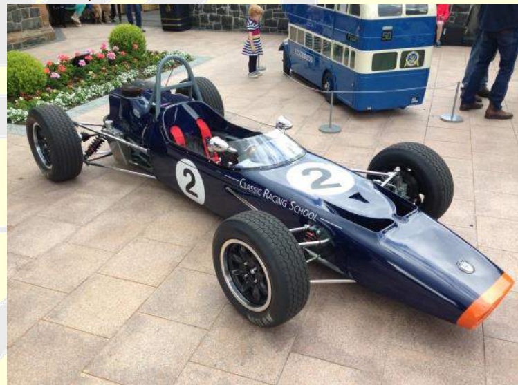
New Crosslé 90F

The morning of the Hill Climb was dry and sunny with predictions of heavy downpours later. I loaded up the road car with the usual assortment of racing kit, tools, spares, etc. adding a bit of lunch and headed for The Hill. After suiting up, a quick coffee and a chat with the other Historic competitors, a look around the interesting cars including the artistic and very expensive red Maserati 150S and the collection of classic Formula Fords, TSCC's theme car for the timed 'shoot-out' later in the day, we gathered for the usual drivers' briefing. Then it was 1 st and 2 nd practice where MG-wise, I was out behind Michael Taylor's racing MG TA and several fast MG Midgets of the Brien family, Bryan Mutch and TSCC membership secretary, Chris Wilson. Practice was dry and my times came close to my previous best. Being in an early group up the hill, I had opportunity for a fleeting nip over to the Manor House to watch some of the faster folk in action and view the excellent static displays of historic Ford Mustangs and contemporary Audis. You could smell the aroma of the expensive brown leather interior of the new Audi R8 V10 from several metres away! Also on display among the race cars was the new Crosslé 90F in blue and although the first new Hollywood made Crosslé in many years, it looks stunning and very much a classic shape.