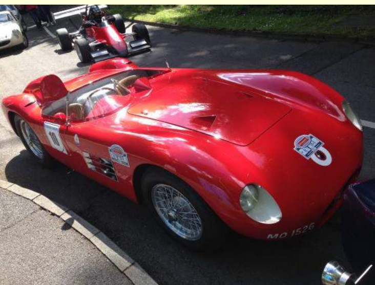
Lovely Maserati 150S

with standard road tyres (stickier Toyos or Yokos required!). However, I survived the damp track (preservation was required for MG Live! ) where others visited the shrubbery! Of course, the sun came back out after the Historics had had their final run.