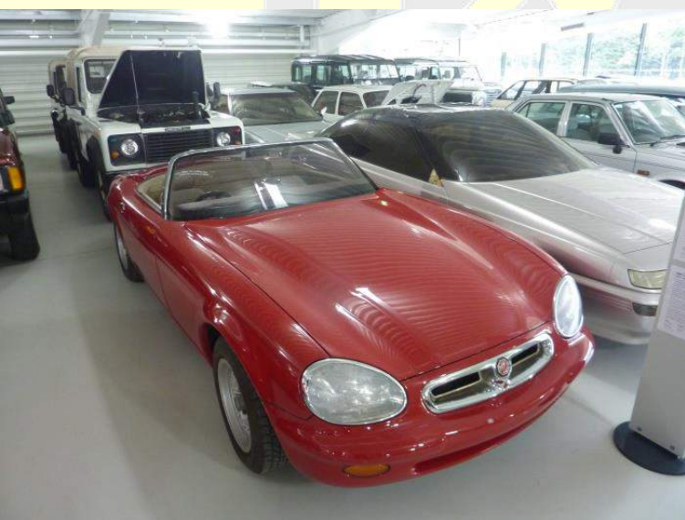
Prototype MG sports sadly never produced

We left the Museum and pointed towards the byways which pervade the Warwickshire and Northamptonshire countryside. The village of Kineton was a few miles from Gaydon and is typical of many such idyllic villages in England with its cross, parish church, flower shop and inevitable village pub. We stopped for refreshment, visited the church and watched as a tank transporter with tank on board negotiated the C road through the village, an everyday sight in the average English countryside! Turned out there's a tank driving range nearby called 'Tanks A lot' where you can have a go in a tank and crush a car of two!