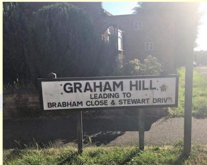
Road sign, Silverstone Village

With the event over, it was time to gather up the kit and think about the drive northwards to the evening sailing at Birkenhead. After a quick sandwich courtesy of 'Chez Mutch' we packed the car and commenced the journey to the M40 motorway via Banbury. I pulled in to the first service there to fuel up and noticed a substantial amount of fluid flowing out of the engine. I had come with many spares – a full set of hoses etc. but the problem turned out to be failure of the heater valve; I had the heater on to dissipate some of the engine heat during the Autosolo. Fortunately, simply turning the heater off reduced the flow substantially and I acquired a couple of plastic two